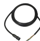
WV-QCA502 I/O Cable for Aero PTZ camera